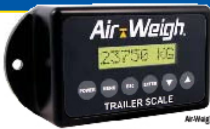
Air-Weigh 5802 Trailer Scale