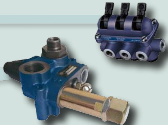
TIPPING VALVES & AIR SWITCHES