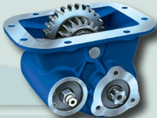
POWER TAKE OFF'S