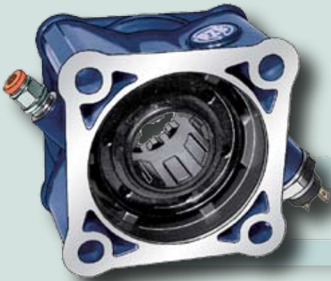
POWER TAKE OFF'S